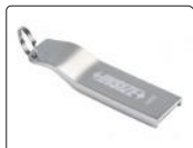
software flash disk (included)